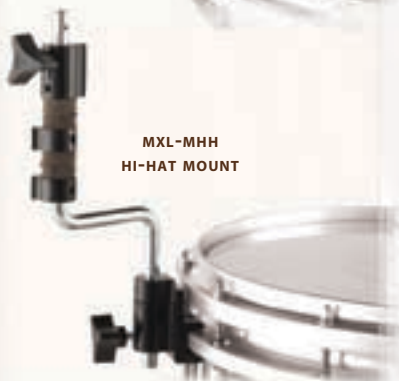
MXL-MHH HI-HAT MOUNT