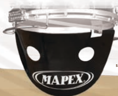
MMSP14BK SNARE PROJECTOR