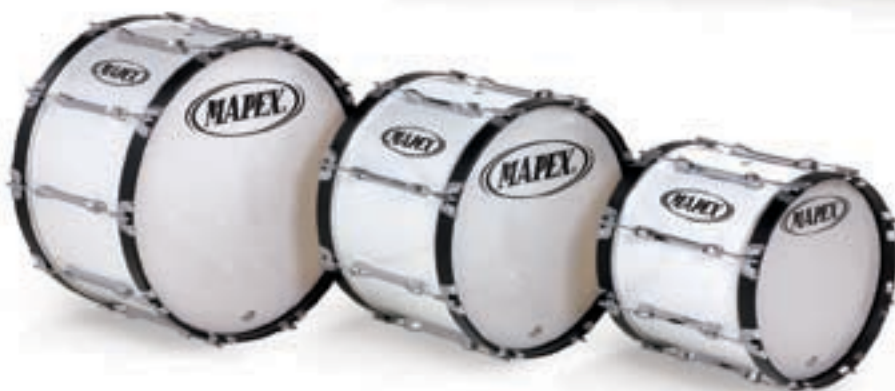
QLB2614sw, QLB2214sw, QLB1814sw BASS DRUMS

The Mapex Qualifier marching drum series offers traditional design and reliable function.