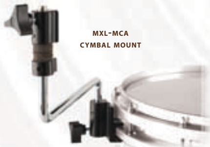
MXL-MCA CYMBAL MOUNT